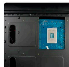
Cutouts on M/B tray