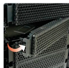
Smart release bay covers