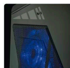
Speed & light control for side 25cm fan