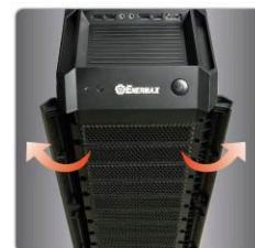
Flip-open design for quick system maintenance