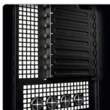
Thumbscrews to secure add-on cards