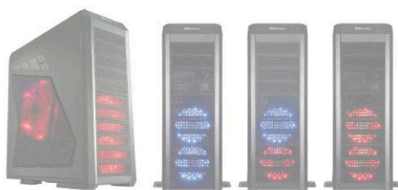
(ECA5010M in different light modes)