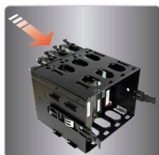
Rails for ODD & HDD installation