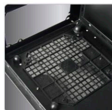
PSU slot with dust filter & rubber stands