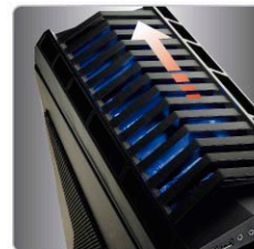
Top slide cover (Fans are optional)